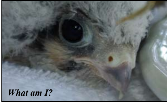
What am I?