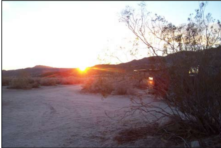
Bow Willow Campground