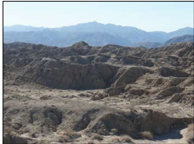
Vallecito Creek: Panorama of the area being surveyed during the Paleo Field Camp.

Our evening activities Monday were dampened but not extinguished by the weather. After potluck dinner in the Shugans' RV, we socialized till around Borrego midnight (9pm). Tuesday night, clearer and warmer than Monday, and wind free, permitted a campfire dinner with no smoke blown in anyone's eyes! But