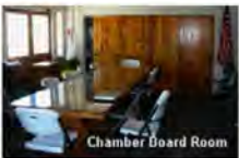
Chamber Board Room